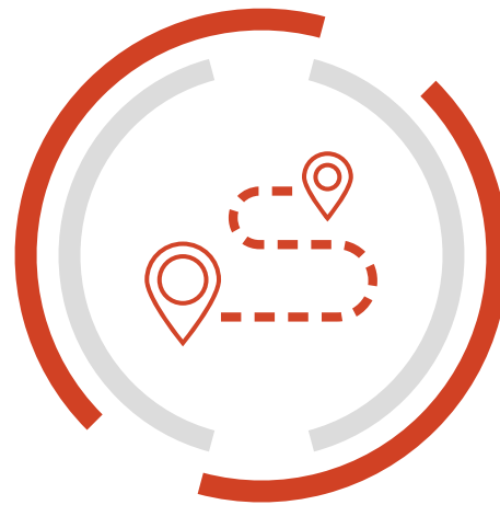
The Rural Student Learning Journey