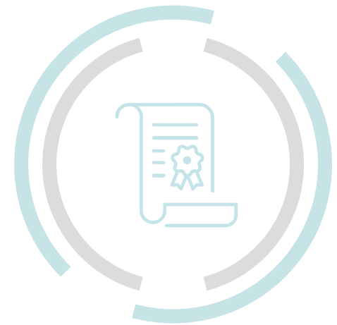
The Value of Postsecondary Education for Rural Learners